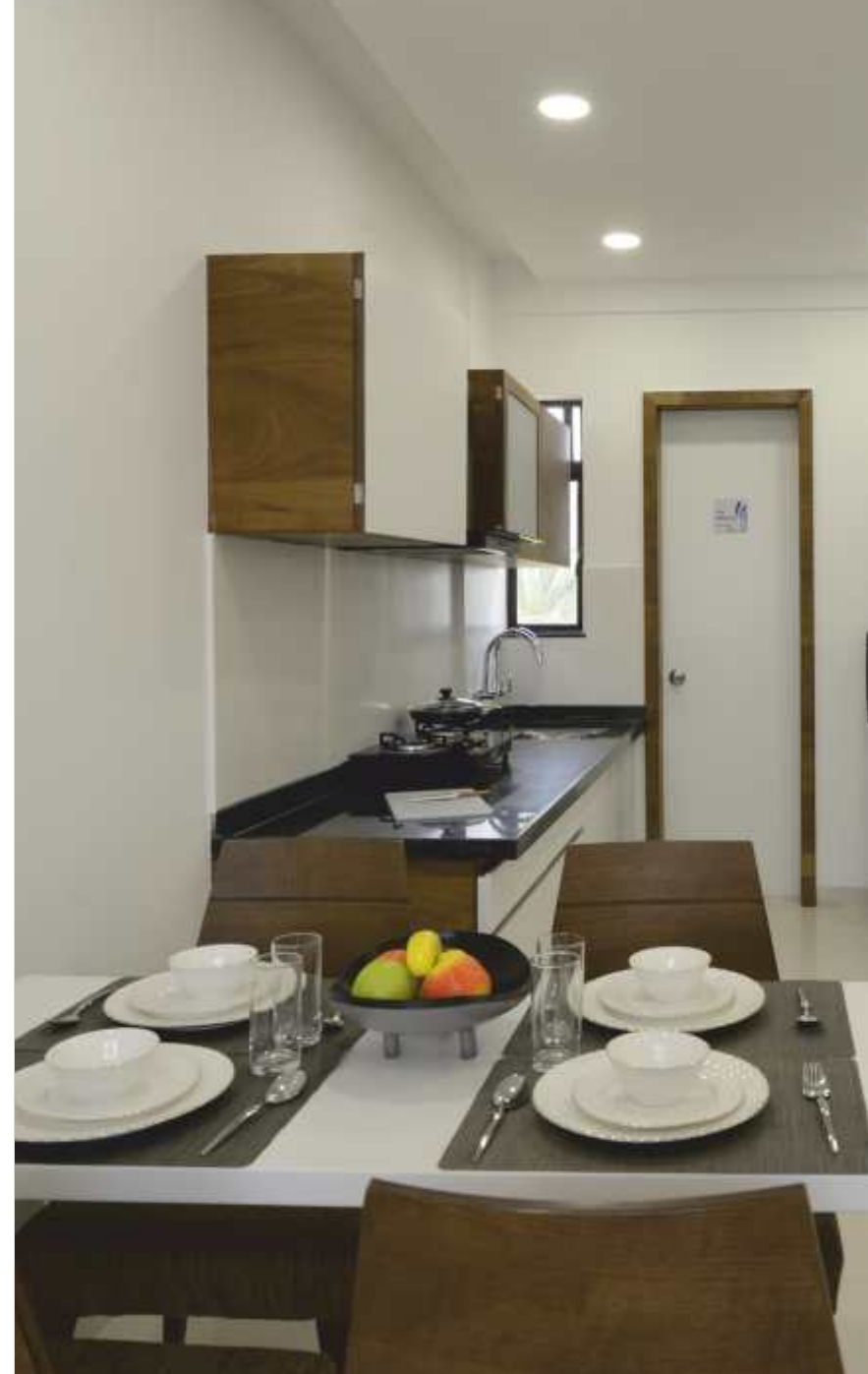
Actual Photograph of Show Kitchen